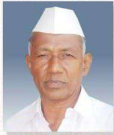
Hon'ble Girjaji Jadhav