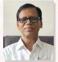
Hon'ble Sampatrao Vaidya