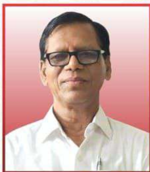
Hon'ble Sampatrao Vaidya