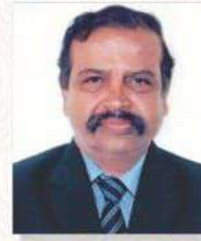
Hon'ble Sureshrao Kote