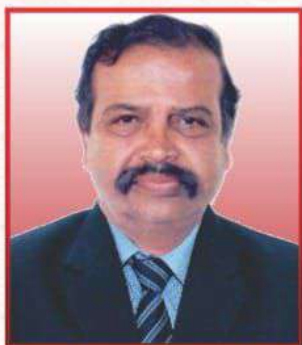
Hon'ble Suresh Rao Kote