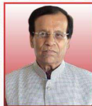
Hon'ble Madhukarro Sonawane