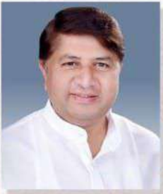
Hon'ble Vaibhavrao Pichad