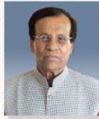
Hon'ble Madhukarrao Sonawane